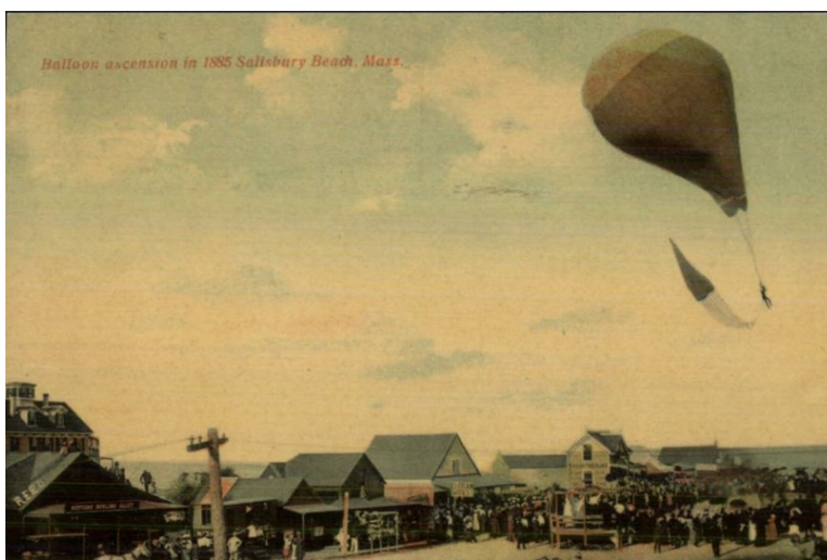
Balloon ascension at Salisbury Beach, 1885. Postcard.