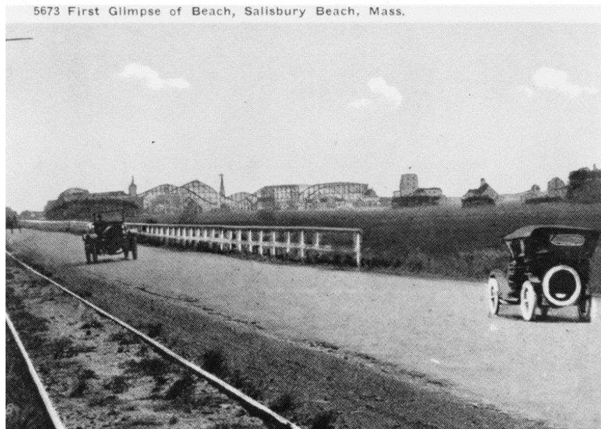
Road to Salisbury Beach c.1910. Postcard.

Transportation to and from the beach from the 1850's through the early 1900's was provided by horse and carriage, railroad, and steamboat. One of these steamboats, called Merrimac , could carry 1,100 people and made two round trips daily during the summer. Pulling carriages full of people and baggage across the sand proved a challenge for the horses so a wooden plank road was built to allow horses and carriages to bring in travelers from the train depot in Salisbury. The new plank road also kept down the dust, which sometimes covered passengers making their way to hotels. Trolley cars soon took over from horse-drawn carriages, but the automobile had become the chosen means of transportation by 1910.