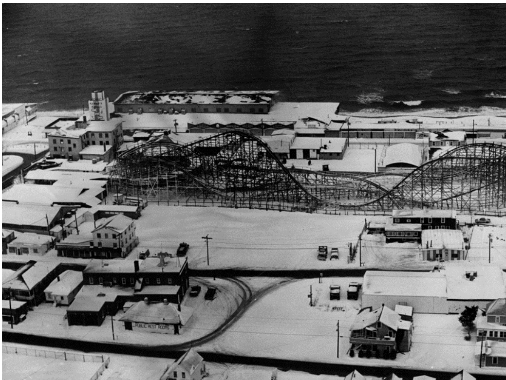
Snow-covered Salisbury Beach in February, 1975. The wooden roller-coaster in the center of the photo was removed in 1977. https://www.boston.com/news/local-news/2014/01/09/salisbury-beach-through-the-years/

Since those days, many attempts have been made to bring the beach's popularity back, but it has never matched its former glory. Still, who knows what the future holds for this historic regional playground? Plans are currently underway to bring back the carousel, and new ideas for rejuvenation always seem to be just around the corner.