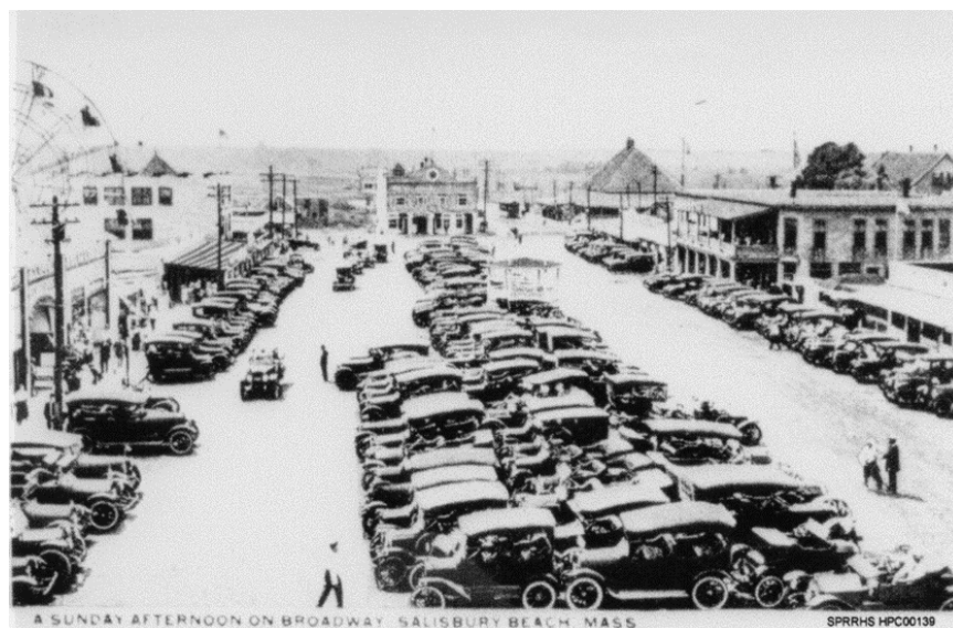
Broadway, Salisbury Beach, c.1910. Postcard. ACM, S.P.R.R.H.S. Collection.